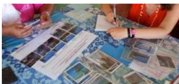
Figure 3: Timeline on which the interviewees were asked to position images. (STORISK survey, Phase 2). = SINGLE FITTING IMAGE / COLOR : ONLINE ONLY.