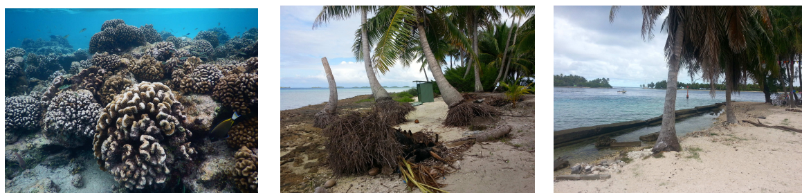
Figure 2: Photographs of environmental changes visible in spring 2017 on Rangiroa (2a. coral bleaching, 2b. beach erosion, 2c. hard defense measures) - STORISK Program = 2-COLUMN FITTING IMAGE / COLOR : ONLINE ONLY.

In addition to these environmental factors, anthropogenic aspects also considerably influence current and future risk levels. Until the 18 th century, the population was concentrated on the most accessible motus, also the highest and best endowed in fresh water. Houses were also built on a coral platform reaching 1.20 m high, and